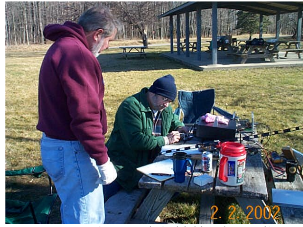
Bet you can't guess who's drinking the Pepsi!