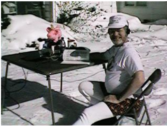
Studying for extra while the radio cools down from all the contacts...LOL