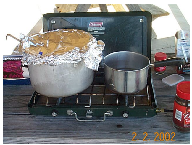
Chicken stuff, with noodles, hot water, and 3, count them, 3 types of coffee!