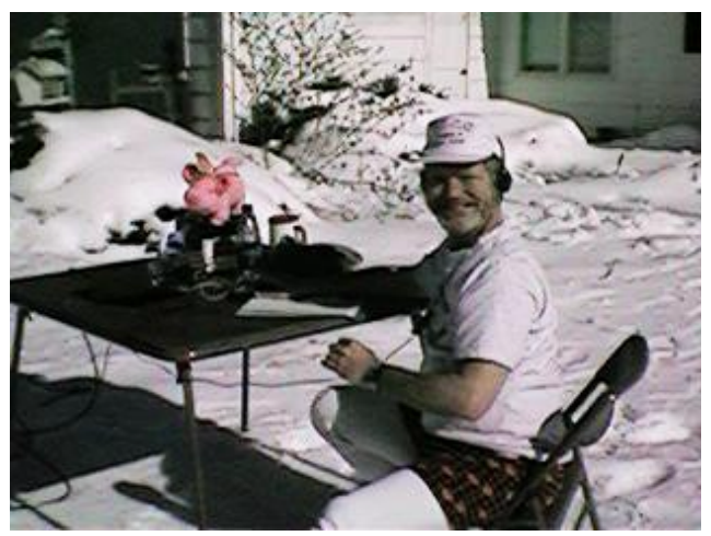
Things got hot with lots of 20 and 10 meter action