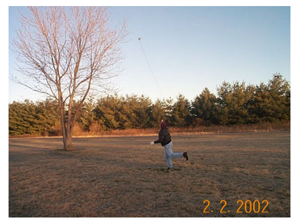
Diz trying to throw a weighted line into a tree. note the kewl dance move!