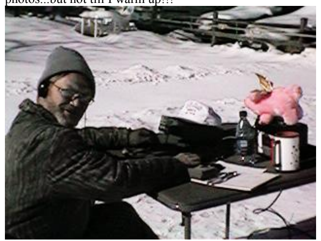
Early on and things are just starting out.

I really ought to write up some verbiage to go with these photos...but not till I warm up!!!