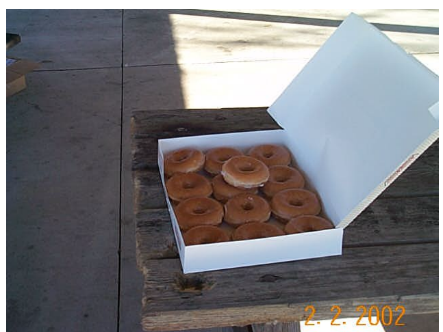
Glazed Toroids as used by team W8PIG!

Lets see we ate 20 donuts, half of a BIG pot of chicken stuff, 2 gallons of coffee, 1 gallon of hot chocolate, 1/5th of anti-freeze, 1 6pack of beer and 3 ham and cheese sandwiches. And 5 piggies.