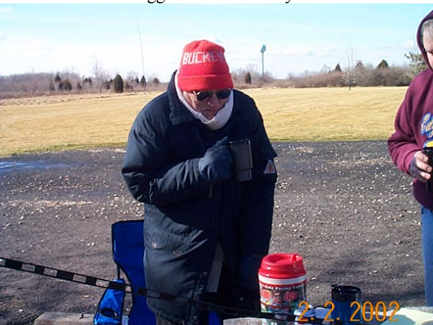
It was an A** S****g wind!