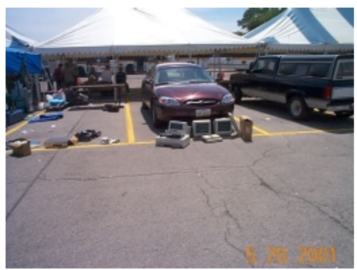
The serial terminals that won't go away!