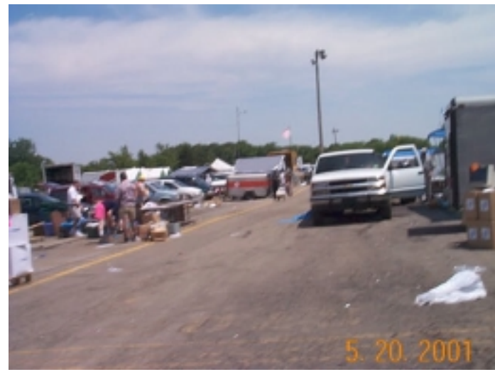
"Hey Dad, is that a 2-meter cavity resonator?", "Shut up son, it's time to go home!", "Awwwww Daddddddd...."