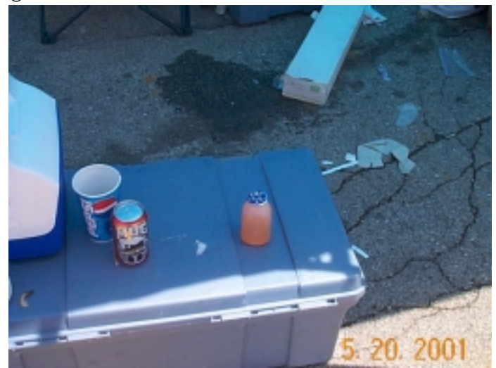
Left over "Fuel".