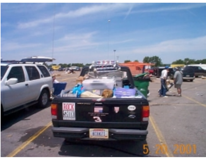
Ahhh, next years "stock". And I bet it's not unloaded until then.