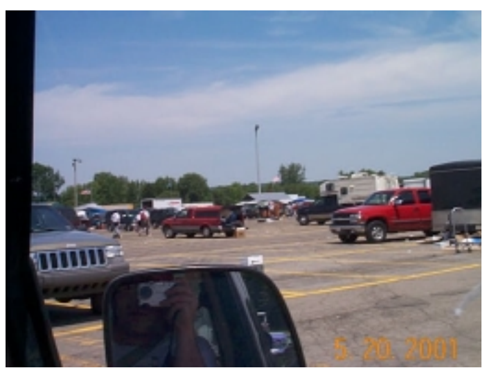
"Boy, some people just can't leave".