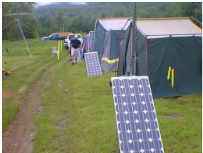
Operating station row, near to far, HF1, HF2, VHF. Each with its own Seimens SP-75 solar panel and deep cycle battery. One continuing comment this weekend was about the blessed absence of the sound of generators. Dick (KG2LN) in background