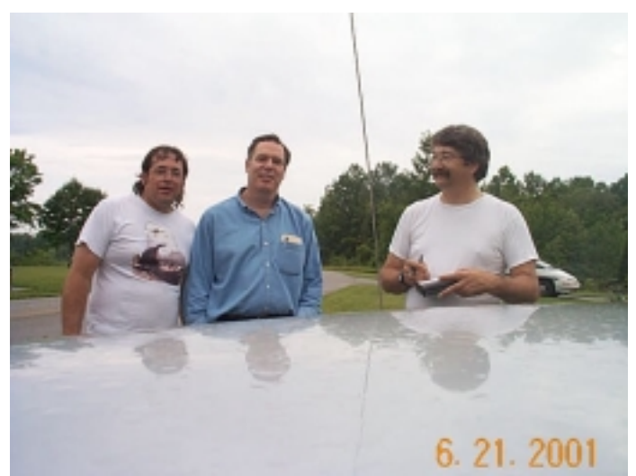
We then went home, to wait, and wait, and count the minutes till 1800z Friday!