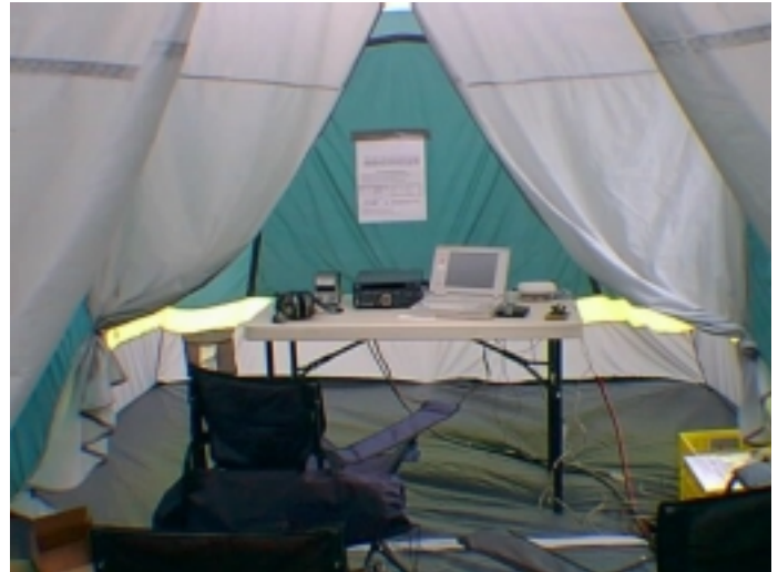
The CW tent, HF2, Fran's TS450 cranked down to 5 watts. The papers taped to the wall are 'cheat sheets' for the <u>TR Logging program</u>. " TR - don't do FD without it! "