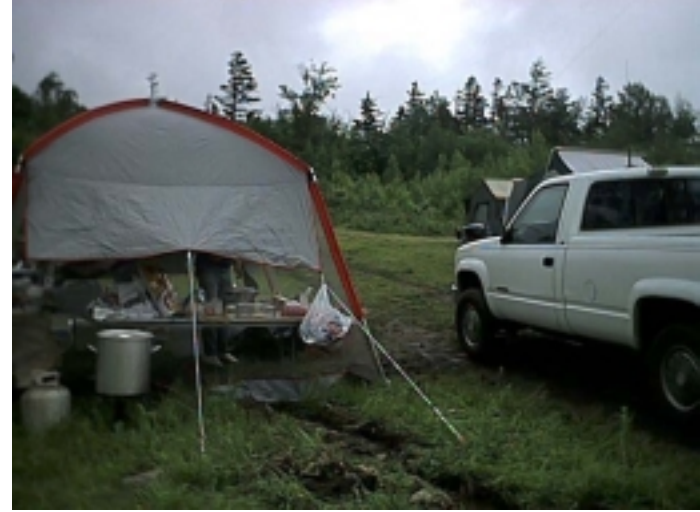
"The Swamp" - a.k.a. the kitchen - look close and you can see the ditch John (KB1ENS) had to dig to drain the swamp (pun intended!)