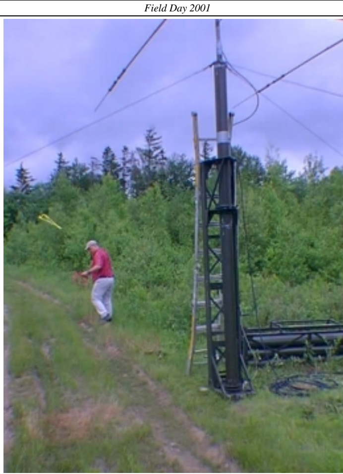
Fran (KM1Z) walking the 40 meter full wave delta loop antenna out away from the AB-577/GRC military surplus crankup tower with Fran's A3S tribander on board