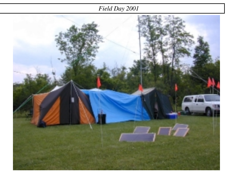
We invited the Park Rangers to come visit (supported agency, we have done a number of SAR operations with them)