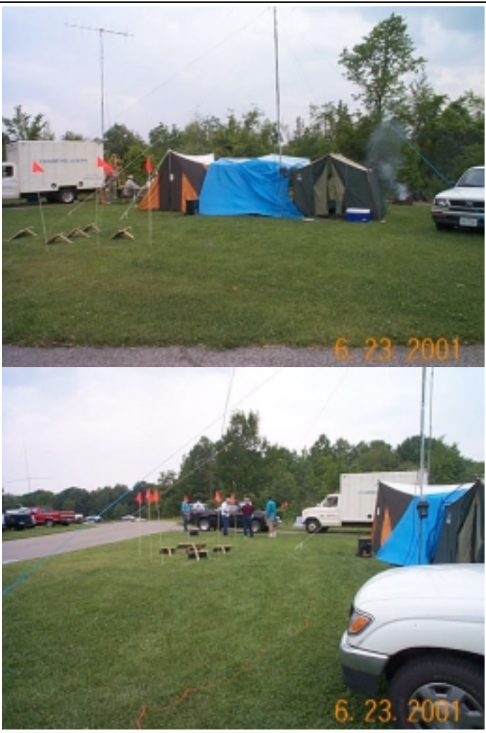
But we managed, next year, though, we may have to get a group camp!

Friday night, we ate, played with radios, and ate some more. Nobody slept much, as the anticipation of Saturday was just too much.