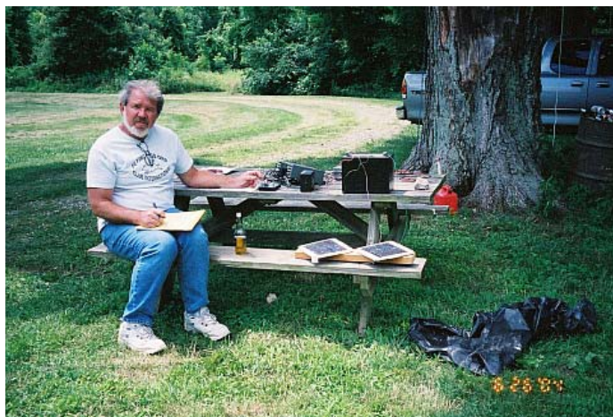
Diz on Deck