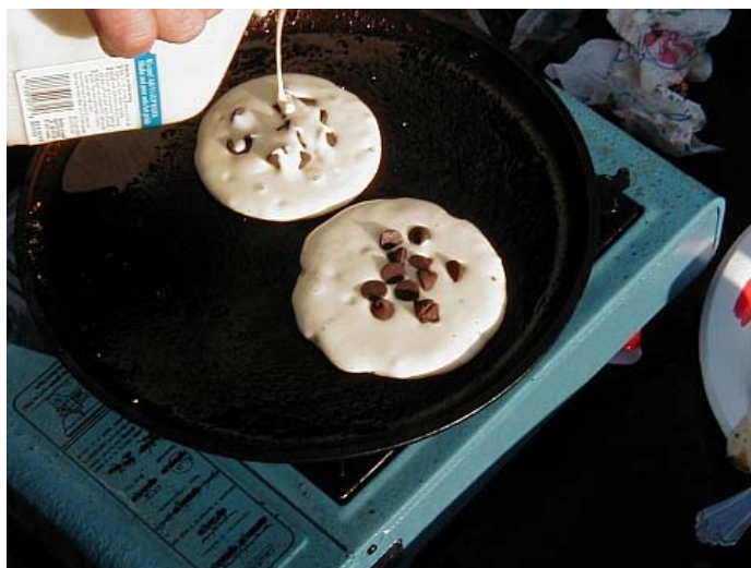
WB8ABE Makes Choco Chip Pancakes!