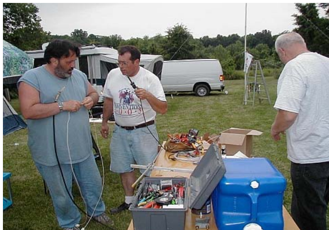
N8IE, WB6JBM, and WB8ABE tasting the iron