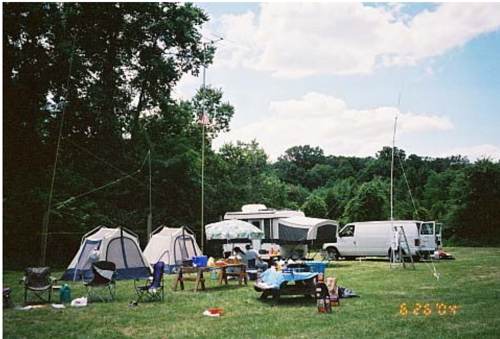
Caesar Creek State Park - Ohio